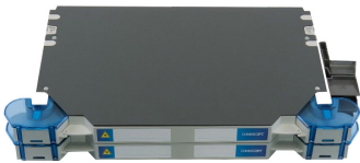
FACT® Fiber Optic Patch Chassis, gray, 2E high, 96-port, multimode, OM4, holding 4 hinged trays loaded with LC/UPC adapters