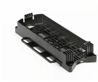
DLX® Mini-MST, Fiber Optic Universal Mounting Bracket