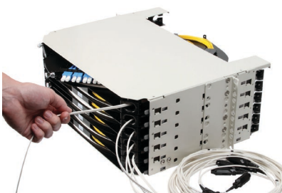
RapidReel Fiber Cable Spool Accelerates Fiber Installation

With the new Rapid fiber panel, the IFC cable is mounted inside the panel on a RapidReel spool, which means the panel features built-in slack storage as well. With up to 100 feet of IFC cable available on the Rapid fiber panel, installers can simply pay out the precise length they need from the internal spool; they no longer have to pay for and store excess cable nor engineer upfront the precise cable length they need.