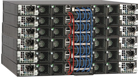
Figure 4: Up to 12 Ruckus ICX 7750 Switches can be stacked using up to 12 standard full-duplex 40 Gbps QSFP+ ports per switch, providing up to 5.76 Tbps of aggregated stacking bandwidth.