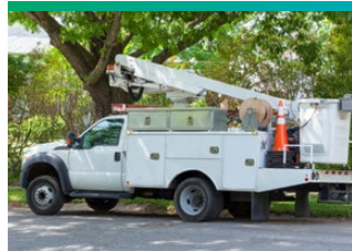
Improved management and service efficiency

Many of today's existing OLTs have been designed for high-density environments, which leads to inefficiencies in hardware utilization when they are deployed in rural markets. In our study, the use of R-OLTs delivered significantly higher hardware utilization due to their ability to be deployed with low initial port counts and scaled through the addition of ports and the transition from a 1:128 split ratio to a 1:64 split ratio when more bandwidth capacity is required.