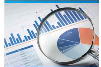
Optimized outside plant investments

In rural environments, it is critical to control the costs of network maintenance and management. We discovered that R-OLTs contributed to a reduction in the volume and complexity of truck rolls in low-density environments. These savings are derived from several features of CommScope's R-OLT and ServAssure solutions, which include cloud-based management, zero-touch provisioning, proactive performance management, and the ability to deliver updates and new features over the network.