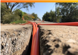
Reduced facilities costs and deployment time

In rural environments, where housing density is low, deploying PON in a traditional centralized architecture can be a challenge due to the need for acquiring land, permitting, and facility construction. Here, the long distances between subscribers can diminish the returns service providers can achieve on their PON investments while slowing network rollouts. But moving the PON launch point deeper into the network using existing feeder fiber and replacing traditional walk-in facilities with CommScope's FLX R-OLT solutions in cabinets can improve both the time and costs of rural PON deployment. These benefits are revealed in detail when we review the key takeaways from a recent study conducted in an area with an average of 7.6 homes per mile (4.7 homes per kilometer).