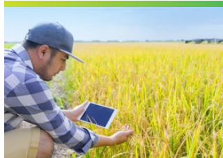
Increased hardware utilization

Constructing a traditional walk-in facility can cost hundreds of thousands of dollars per site and take several months to complete. But deploying an environmentally hardened R-OLT demonstrated a 40 to 80 percent savings. These savings stem from the reuse of existing housings, enclosures and fiber, the ability to scale ports incrementally, and the R-OLT's smaller R-power footprint. We also found deployment time to be reduced by 70 to 80 percent when compared to the construction of traditional facilities, due to the reduction or elimination of costly and time-consuming permitting requirements.