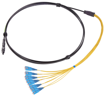
Fiber Test Cable Assembly, HMFOC Jack/Pinned/Male to 12 SC/UPCs, 10 Feet